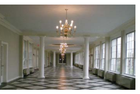
Roosevelt Warm Springs Institute for Rehabilitation, Warm Springs, Georgia; (Top to bottom) Quadrangle, Roosevelt Hall, Columbus Colonnade, Inside Georgia Hall

Living with Polio in the 21st Century is the theme guiding the program of Post-Polio Health International's 10th International Conference.